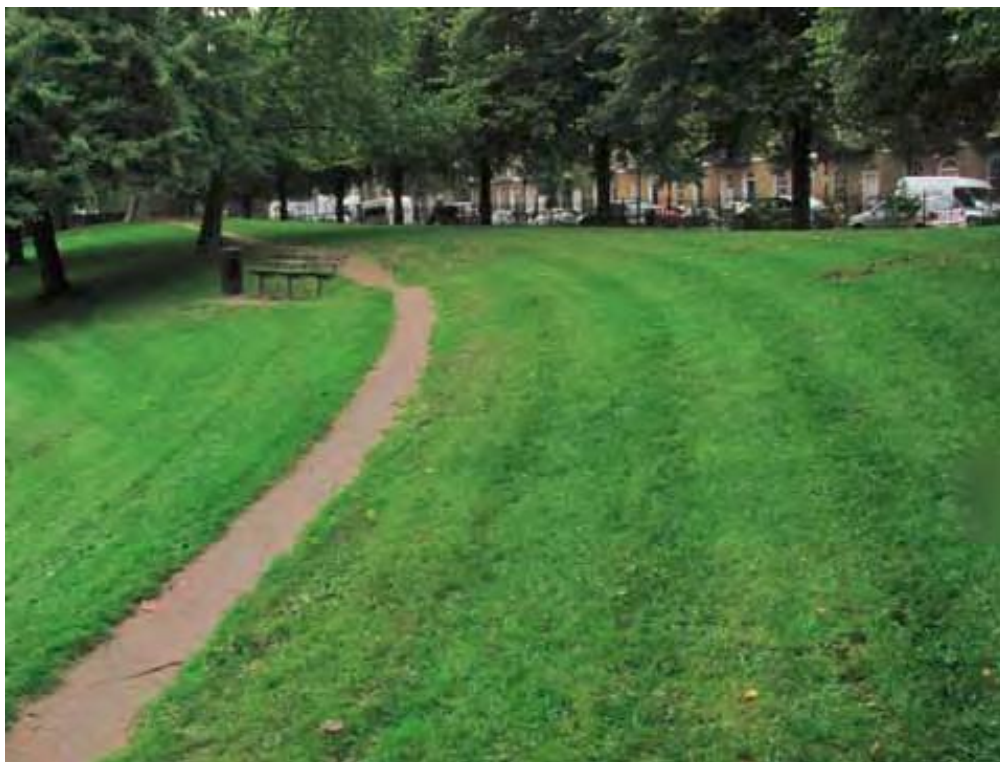
Image 3: View of the park and existing footpaths (access from Barnsbury Road)